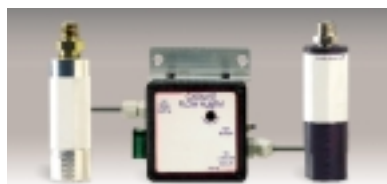
The Catalyst Flow Alarm will alert an operator to any change in catalyst or resin flow at virtually any flow rate.

For maximum versatility, the LEL model #207-12240 can be used with either a flo-coater tip or a spray tip.