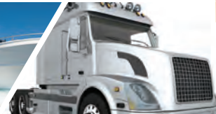
TRUCK AND BUS