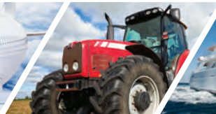
AGRICULTURAL AND OFF ROAD